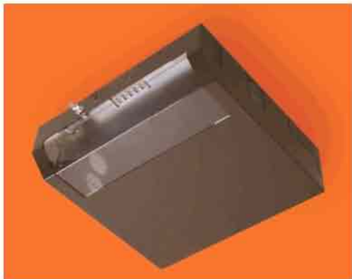
VERTICAL OPENNING ON CEILING